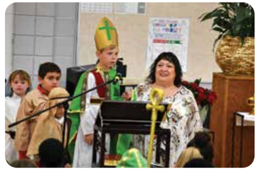
All Saints Day