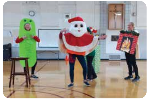
Middle School Christmas Lip Sync Contest