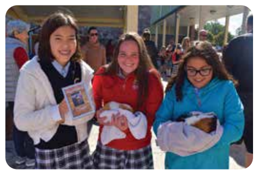
Blessing of the Animals