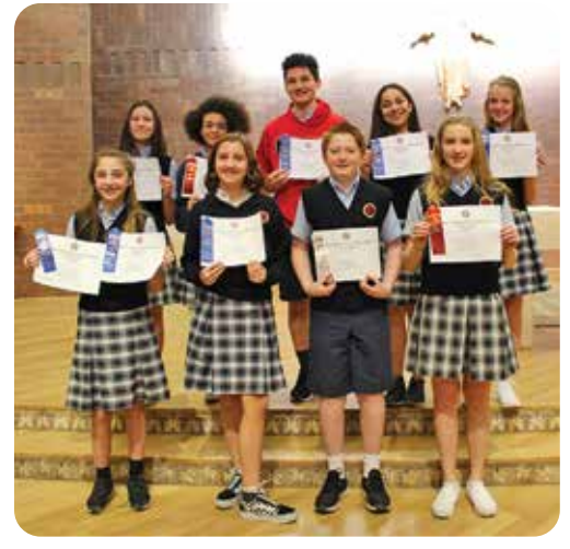
Science Fair Awards