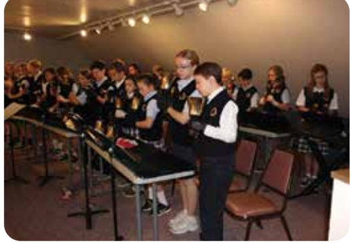
St. Vincent 6th Grade Bell Choir at Funeral Mass