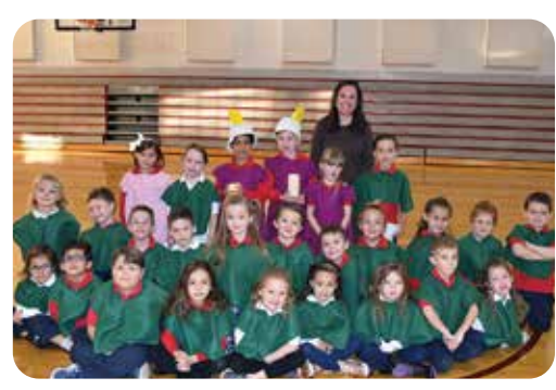
Advent Prayer Services