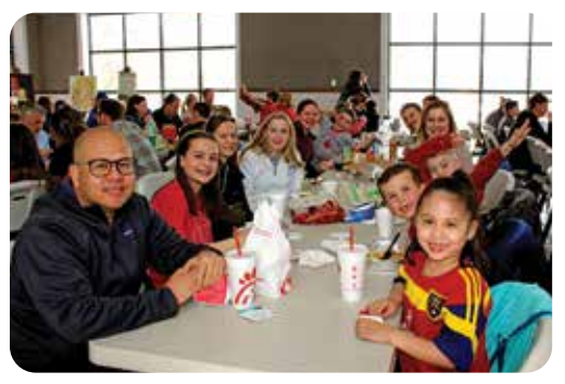
Catholic Schools Week Family Lunch