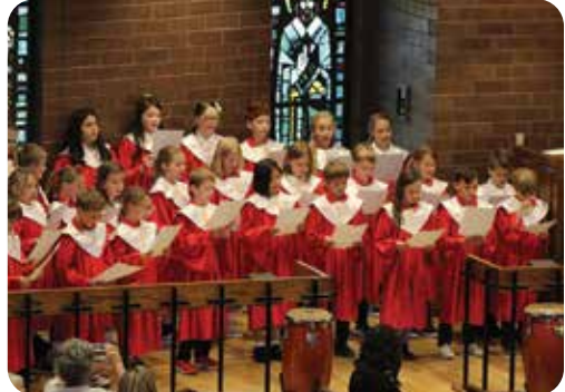
St. Vincent School Choir at Funeral Mass