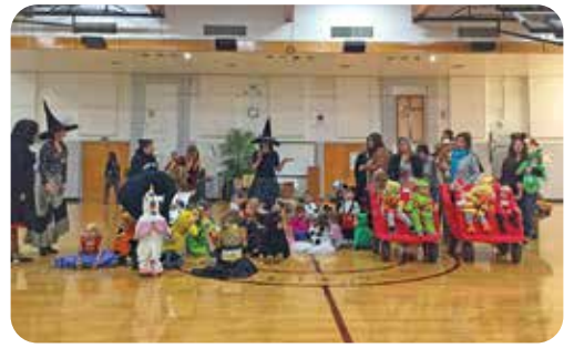
Nano Nagle Halloween Parade