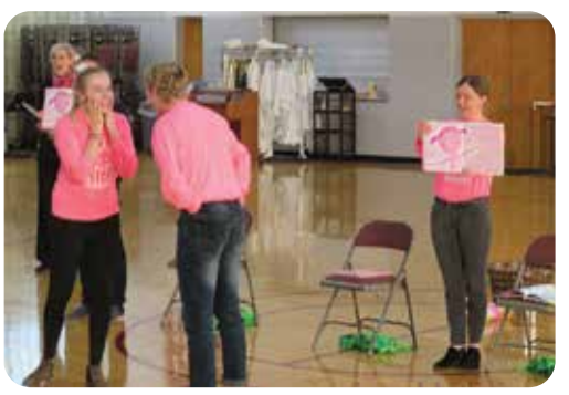
Salt Lake Acting Company's "Pinkalicious"