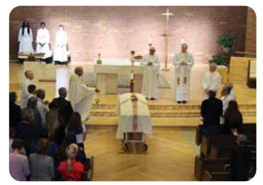
Funeral Mass at St. Vincent de Paul Parish