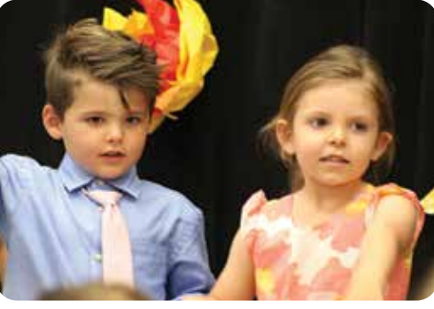
Pre-K Spring Program