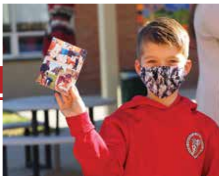
Blessing of the Animals