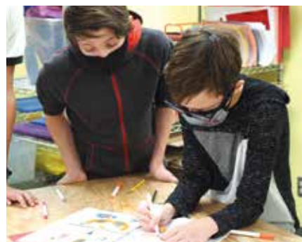
8th Grade Retreat