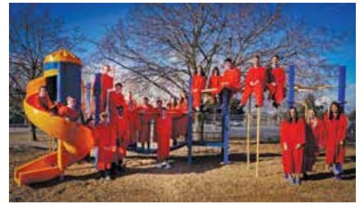
Class of 2021 Playground Fun