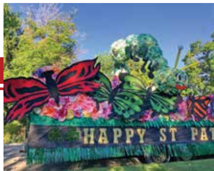
St. Patrick's Day Float