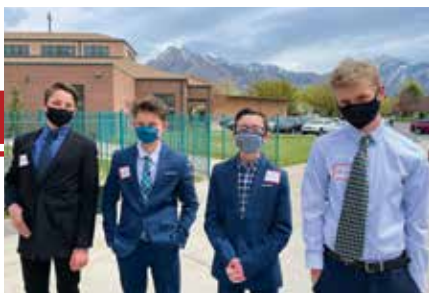
8th Grade Confirmation Day