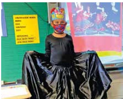
2nd Grade Country Reports