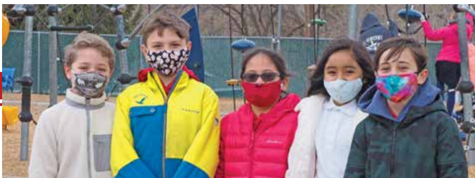
Outside for a Break