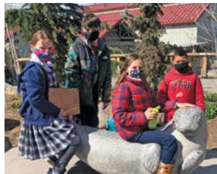
Hogle Zoo Field Trip