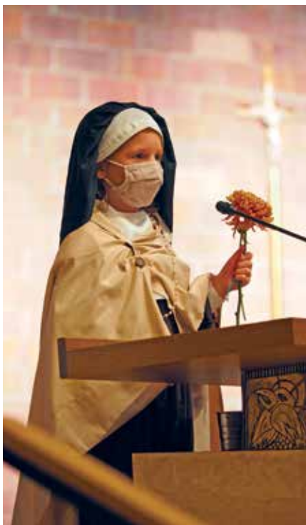
All Saints Day