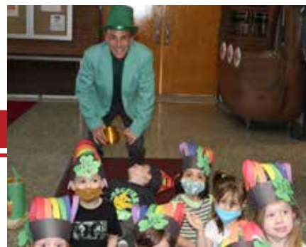
Pre-K Leprechaun Catchers