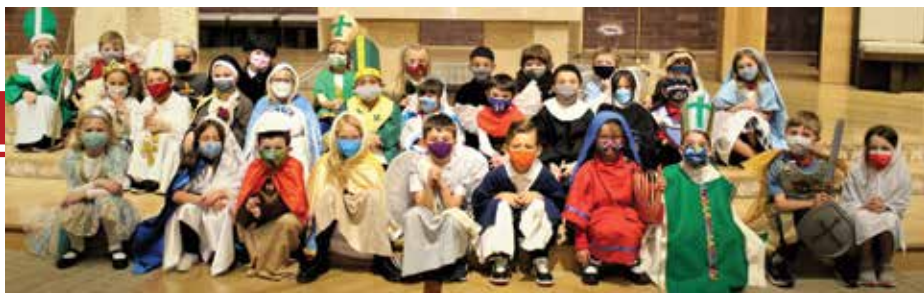
All Saints Day