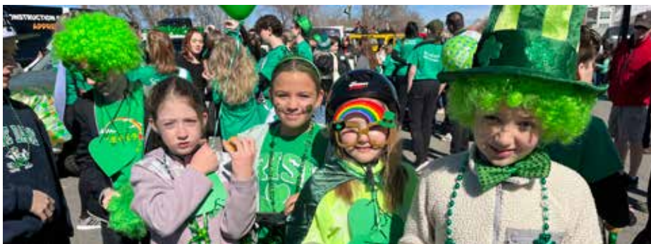
Saint Patrick's Day Parade