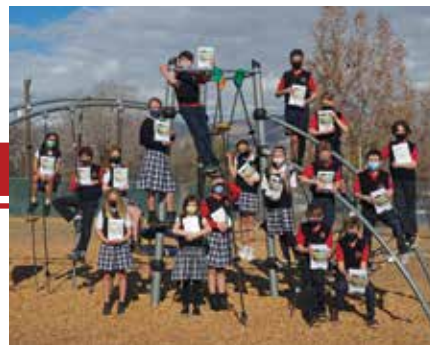
5th Grade Bibles