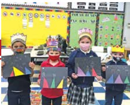
Kindergarten Three Kings Day