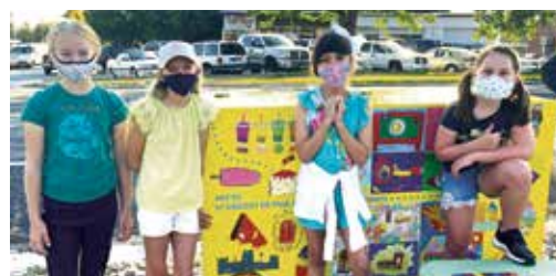
Students giving back to the Holladay Community sharing their artwork at the Soho Food Truck Park