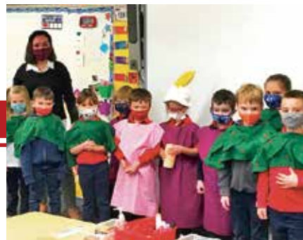
Kindergarten Advent Service