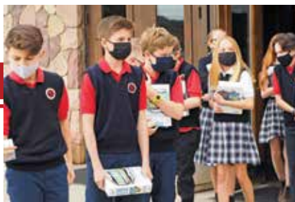
5th Grade Bibles