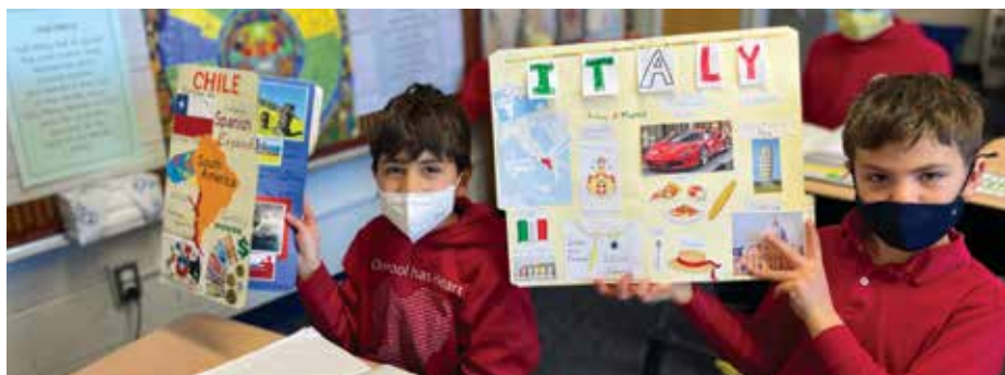
2nd Grade Ancestry Reports