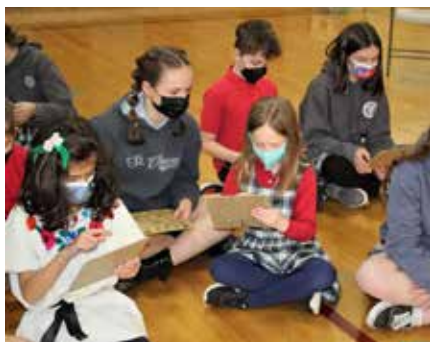
Mardis Gras Bingo