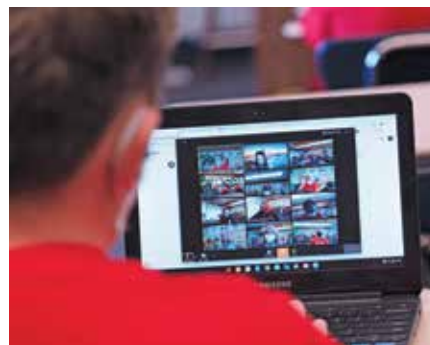
Online and In-Class Flex