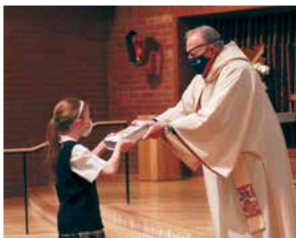
5th Grade Bible Ceremony