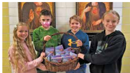
Giving alms for Lent