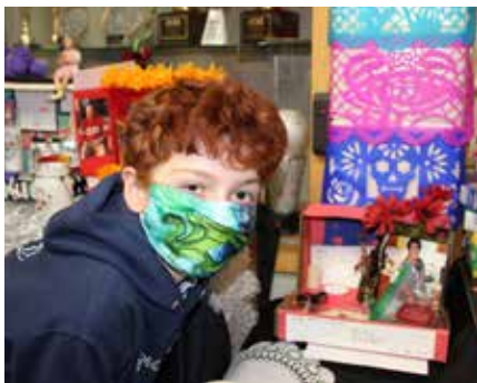
Day of the Dead Displays