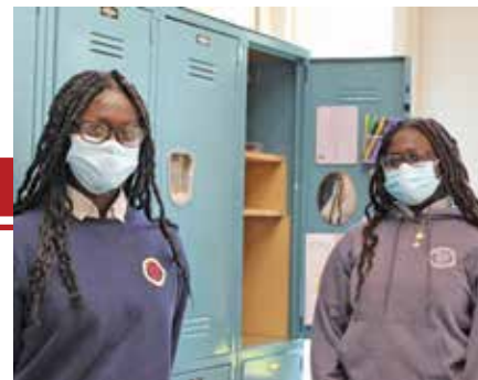
First Day of School