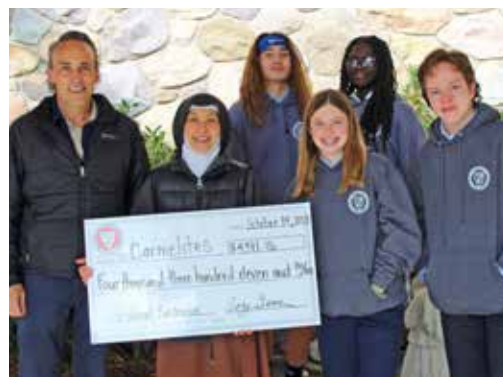
Student Council's Penny Challenge raised $4,311.16 to benefit the Carmelite Monastery