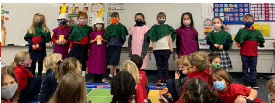
Kindergarten Advent Prayer Service