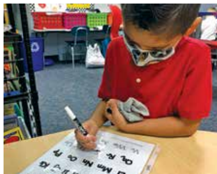
Lit Team Class