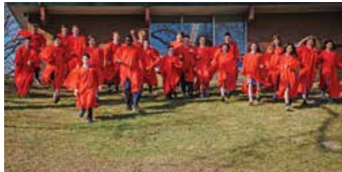
2021 Class Run