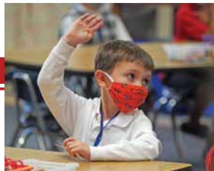
Making Good Habits