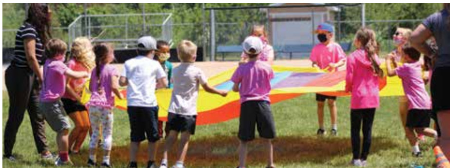
More Field Day