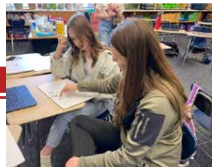
Middle School Math Program