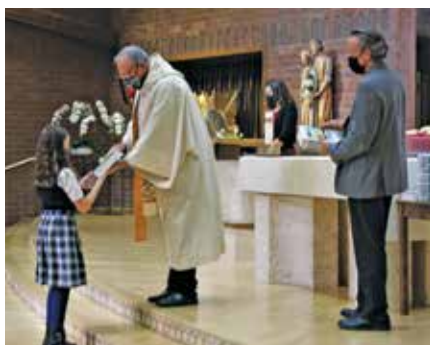
5th Grade Bible Ceremony