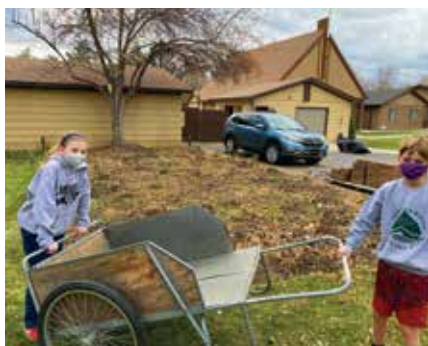
Carmelite Rectory Clean Up