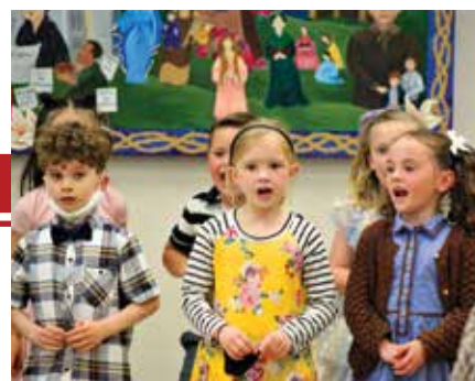
Kindergarten End-of-Year Program