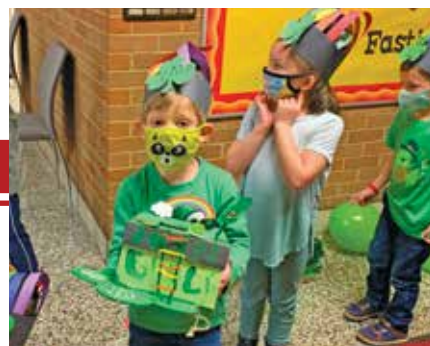
Pre-K Leprechaun Catchers