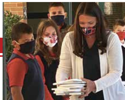
Burying the Alleluia