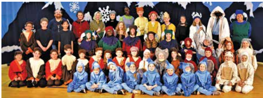
Missoula Childrens' Theatre