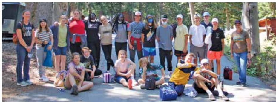
8th Grade Camp Tuttle Retreat