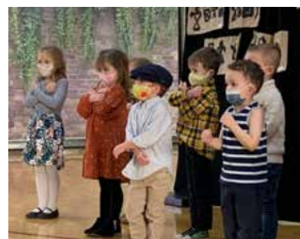
Pre-K Thanksgiving Program