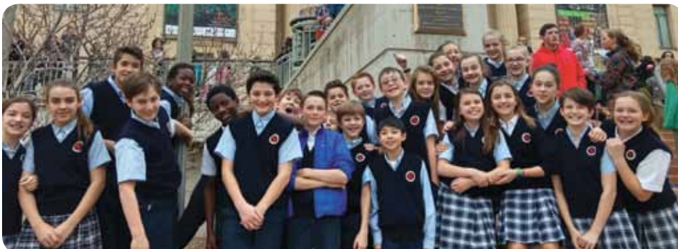
Sixth grade visit to Kingsbury Hall