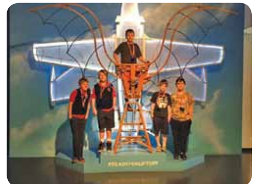
Fifth grade visit to The Leonardo