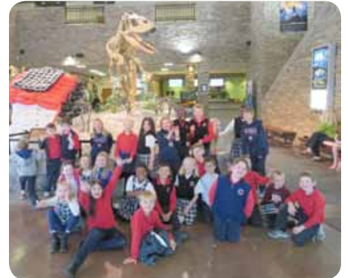
Second grade field trip to Thanksgiving Point