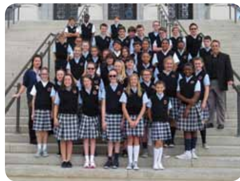
Saint Vincent bell ringers and choir perform at the State Capitol Centennial Celebration

Saint Vincent School bell ringers and choir performed at the State Capitol for the Capitol Centennial Celebration. They were the only Utah Catholic School to perform for the century celebration. Missoula Children's Theatre held their week-long performing arts program after school in April. This year's production was "The Tortoise vs. The Hare."